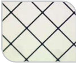
8µm lines in cross-hatch