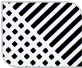
1mil negative cross-hatch