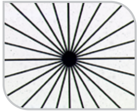
10µm lines in different angles