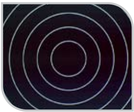
8µm lines in circular patterns